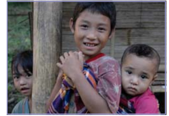
3 Karen Children inside Burma

We build teams and partner with the best organizations so that every day we can improve the way in which relief is provided.