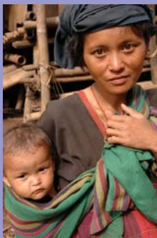
Karen woman and child in Eastern Burma