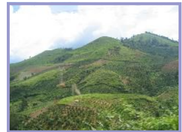
The terrain , elevation, soil and climate in Northern Thailand is great for coffee farms.

We will produce a medium and a dark roast so you can decide what is best for you. Visit our website in Mid January and give our beans a try. Tell all your caffeinated friends....lets go Beyond Borders!!!